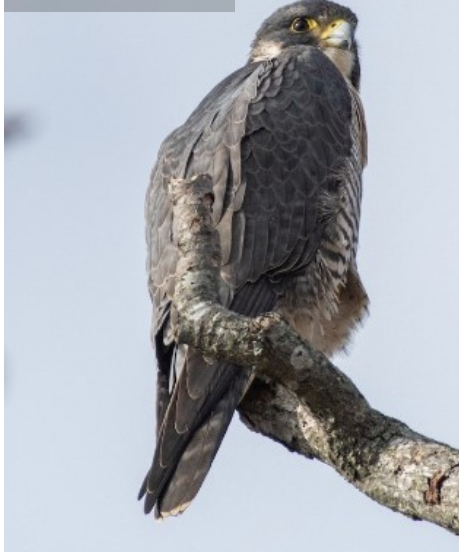
Beach State Park

These statutes use criteria like how many individuals of a species are left in the wild, how quickly their population or habitat size is shrinking, or whether the species is likely to experience existential threats to determine if it should receive designations like Threatened or Endangered . 3 Those labels, once applied, offer that species some of the most binding legal protection possible. Such protections successfully brought raptors like Bald Eagles and Peregrine Falcons back from the brink of extinction by banning the use of the pesticide DDT. 4 They also make Endangered designations the subject of fierce political debate, particularly when that designation would result in realized or potential economic harm (the contentious debate over whether Gray Wolves should be protected as an Endangered Species 5 falls into this category).