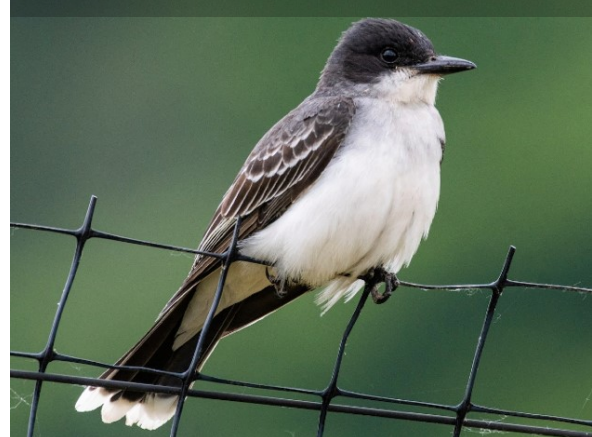
Eastern Kingbird in the KLT Community Garden

Like much community-collected data, the checklists submitted to eBird may include some inaccuracies. However, safeguards are in place to avoid faulty information about sensitive species. When checklists include rare-marked species (for eBird users, these