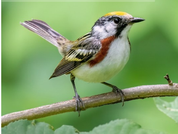
Chestnut-sided Warbler in my parents' yard

As an ecologist-in-training, questions of tractability often bother me. When I study a natural system, am I asking questions worth answering? And – once I have answers – are they actually usable to conserve, protect, or help that system survive?