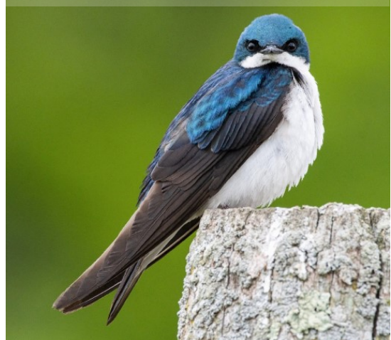
Tree Swallow in the KLT Community Garden

Take, for example, the designation of a species as Endangered . Here in the United States, we usually think of such species in terms of the Endangered Species Act of 1972, our country's dominant law for protecting vulnerable species from further perils and restoring their populations to safer levels. 1 On a global scale, these designations are also classified according to the International Union for Conservation of Nature (IUCN) Red List, which serves a similar function. 2