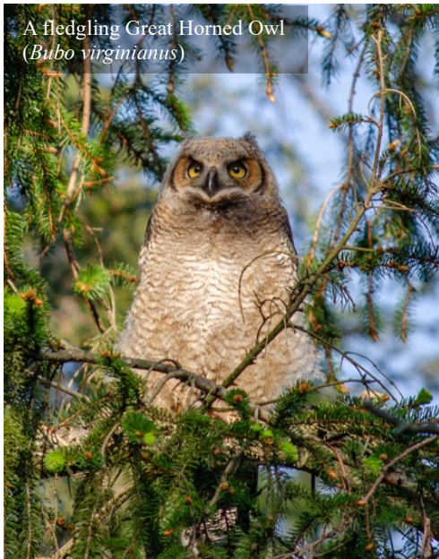
A fledgling Great Horned Owl ( Bubo virginianus )

This is the real difficulty with the classic “perfect” lawn. The cost of maintaining an uninterrupted monoculture of undisturbed grass often comes from the tools required to cultivate it as such: pesticides. And that cost, unfortunately, cannot be contained within the neatly defined boundaries of our yards.