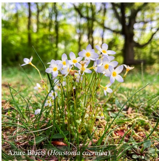
Azure Bluets ( Houstonia caerulea )

What exactly is the “perfect” lawn? The classic picture, familiar to us all from John Deere commercials and suburban coming-of-age movies, has become a comfortable norm: perfect squares of emerald green grass, each blade cut to exactly 2.5 inches tall in identical, uninterrupted stripes.